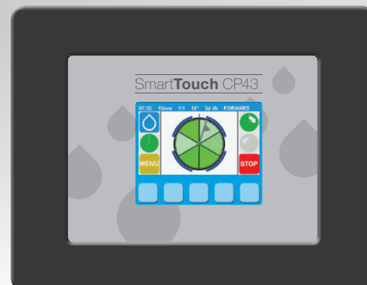
SmartTouch CP 43